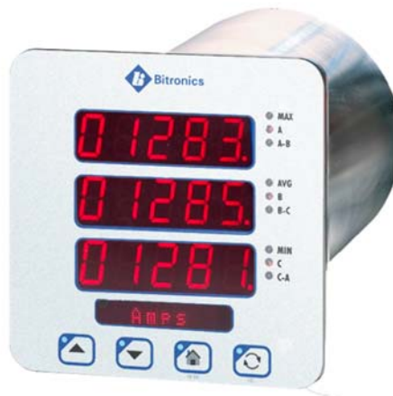
D650 Detached Display