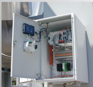
Custom enclosure with Bitronics 70 Series instrument and peripherals