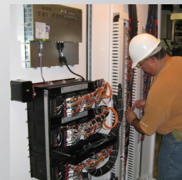
On-site at DC-area substation