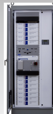
RTU Panel with Orions and DDIOs