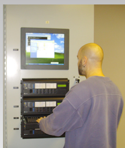
NovaTech engineer checking out RTU panel with HMI and automation controller