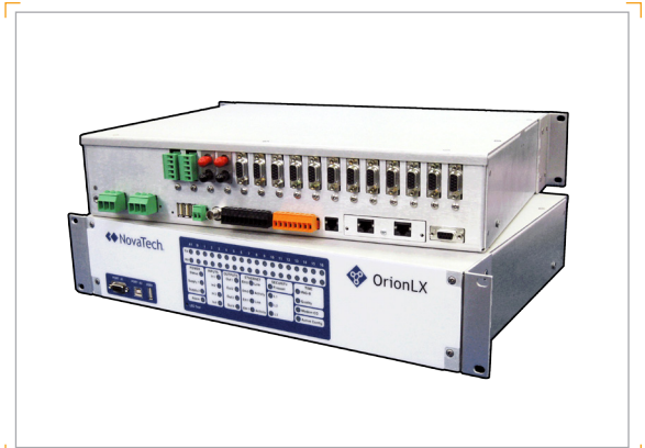
OrionLX Front and Rear View