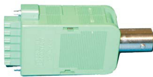
Modulated IRIG-B Converter