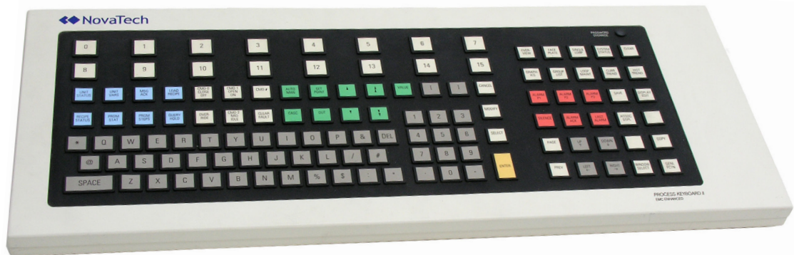
D/3 USB Keyboard

See Operator Console User's Guide for additional information about the D/3 Keyboard functions.