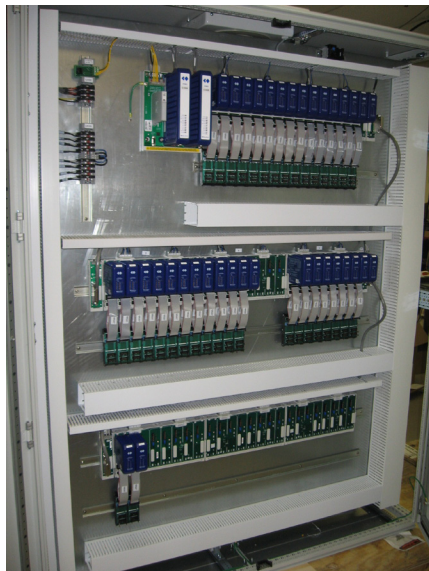
4-Door 8000 I/O