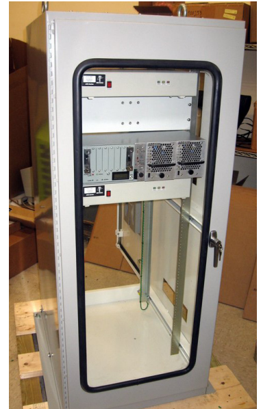
Custom Power Supplies