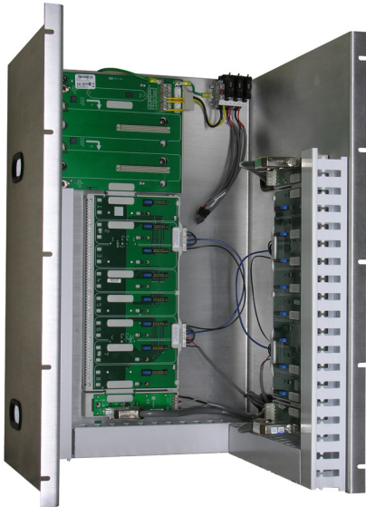
Custom 8000 I/O Retrofit Kits