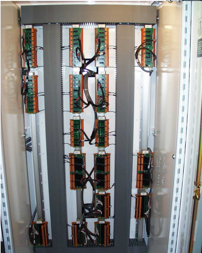
Modicon I/O Custom Terminations