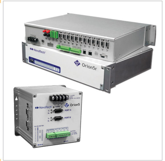
DA-Master is a software module for either the Orion5 or Orion5r Automation Platform